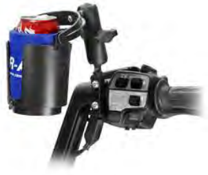
RAM-B-132-309U RAM DRINK CUP HOLDER WITH GOLDWING