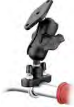
RAM-B-149ZAU RAM RAIL MOUNT WITH A SIZE ARMS