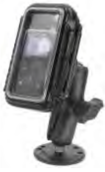
RAM-B-138-AQ3 RAM MOUNT WITH 2 7/16" BASE FOR AQUA BOX MEDIUM