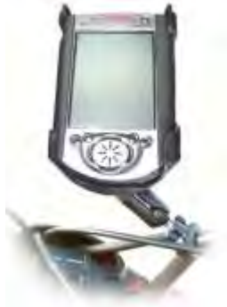
RAM-B-149Z-CO1 RAM U-BOLT MOUNT FOR THE HP IPAQ