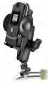
RAM-B-149Z-UN1 RAM UNIVERSAL RAIL MOUNT FOR SMALL SIZE DEVICES