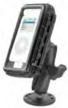
RAM-B-138-AQ2 RAM MOUNT WITH 2 7/16" BASE FOR AQUA BOX MEDIUM