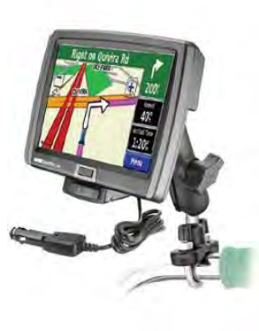
RAM-B-149Z-G3U RAM MOUNT WITH U-BOLT FOR THE GARMIN 7200