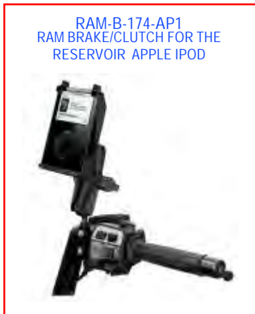
RAM-B-174-AP1 RAM BRAKE/CLUTCH FOR THE RESERVOIR APPLE IPOD