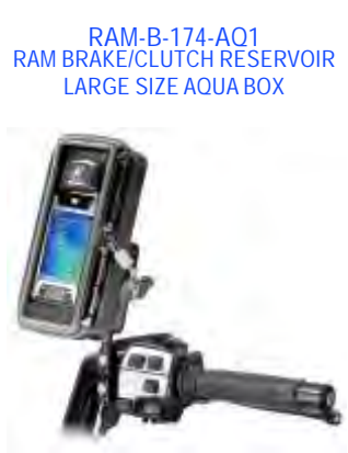
RAM-B-174-AQ1 RAM BRAKE/CLUTCH RESERVOIR LARGE SIZE AQUA BOX