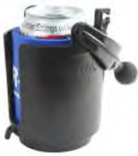
RAM-B-132BU RAM DRINK CUP HOLDER WITH 1" BALL