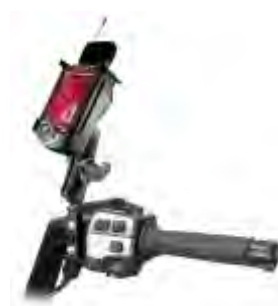
RAM-B-174-CO1 RAM BRAKE/CLUTCH RESERVOIR FOR THE HP IPAQ 3600 & 5000 SERIES