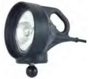
RAM-B-152B RAM SPOTLIGHT WITH 1" BALL