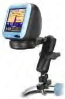
RAM-B-149Z-TO1U RAM U-BOLT MOUNT FOR THE TOMTOM GO