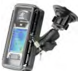
RAM-B-149Z-AQ1 RAM SUCTION MOUNT LARGE SIZE AQUA BOX