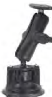
RAM-B-166 RAM SUCTION MOUNT TWIST LOCK