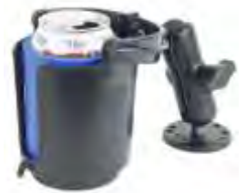
RAM-B-132U RAM DRINK CUP HOLDER MOUNT