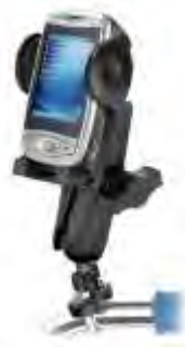
RAM-B-149Z-UN2 RAM UNIVERSAL RAIL MOUNT FOR MEDIUM SIZE DEVICES