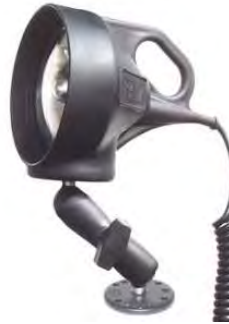
RAM-B-152 RAM SPOTLIGHT WITH MOUNT & STUD BASE