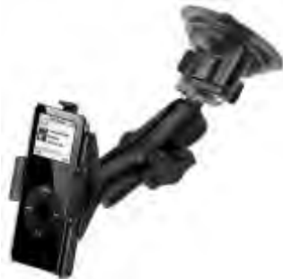
RAM-B-166-AP2 RAM SUCTION MOUNT FOR THE APPLE IPOD NANO