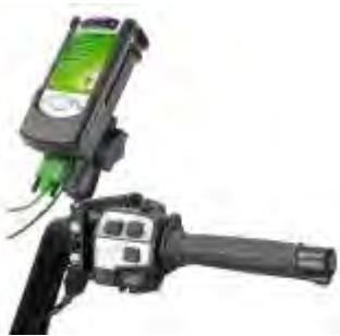
RAM-B-174-CO2P RAM BRAKE/CLUTCH RESERVOIR POWERED DOCK FOR HP IPAQ 3000 & 5000 SERIES