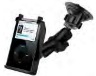
RAM-B-166-AP1 RAM SUCTION MOUNT FOR THE APPLE IPOD