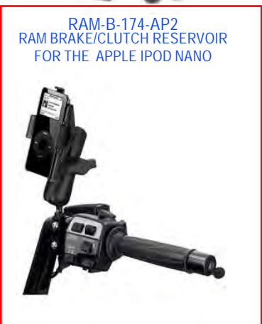
RAM-B-174-AP2 RAM BRAKE/CLUTCH RESERVOIR FOR THE APPLE IPOD NANO