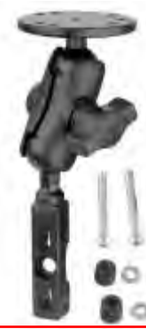
RAM-B-174-202AU RAM GOLDWING WITH 1/4"-20 MALE CAMERA MOUNT