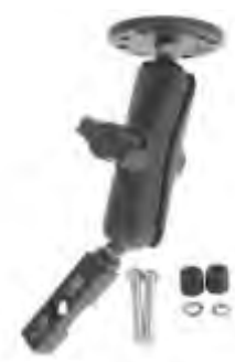
RAM-B-174-202U RAM GOLDWING WITH 2.5 DIAMETER BASE