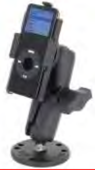
RAM-B-138-AP2 RAM MOUNT WITH 2 7/16" BASE FOR APPLE IPOD NANO