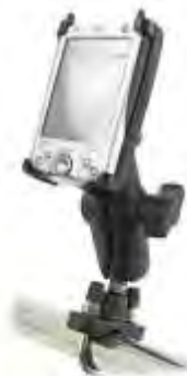
RAM-B-149Z-CO3 RAM U-BOLT MOUNT FOR THE HP 2000 IPAQ