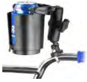
RAM-B-132RU1 RAM DRINK CUP HOLDER WITH U-BOLT BASE