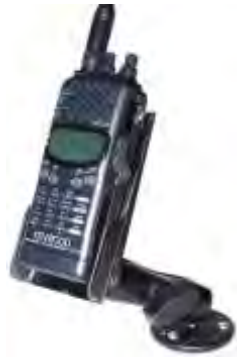
RAM-B-138-BC1 RAM MOUNT WITH BELT CLIP HOLDER HAND-HELD