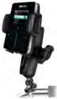
RAM-B-149Z-UN3 RAM UNIVERSAL RAIL MOUNT FOR MEDIUM SIZE DEVICES