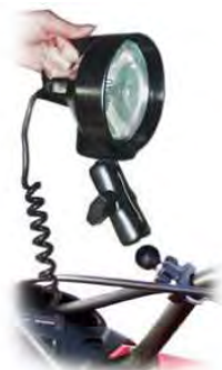
RAM-B-152R RAM SPOTLIGHT WITH MOUNT & U-BOLT BASE