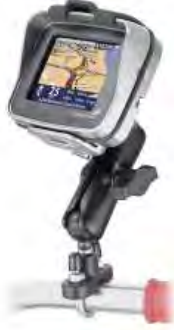
RAM-B-149Z-TO2 RAM RAIL MOUNT FOR THE TOMTOM RIDER