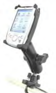
RAM-B-149Z-DE1 RAM U-BOLT MOUNT FOR THE DELL AXIM X5