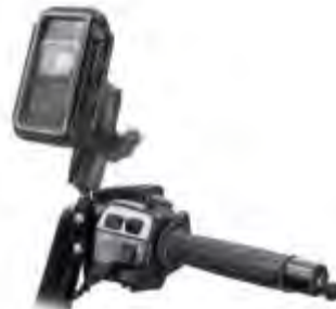
RAM-B-174-AQ3 RAM BRAKE/CLUTCH RESERVOIR SMALL SIZE AQUA BOX