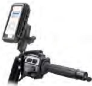
RAM-B-174-AQ2 RAM BRAKE/CLUTCH RESERVOIR MEDIUM SIZE AQUA BOX