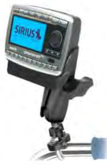
RAM-B-149Z-XM1 RAM RAIL MOUNT FOR XM SATELLITE RADIOS