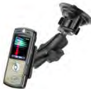
RAM-B-166-300 RAM SUCTION MOUNT WITH POWER PLATE