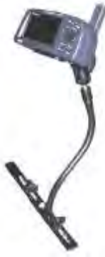
RAM-B-131-G1 RAM AIRCRAFT SEAT RAIL MOUNT FOR GPS