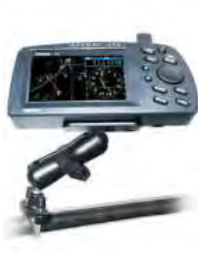
RAM-B-149Z-G1 RAM MOUNT WITH U-BOLT BASE & MOUNTING HARDWARE