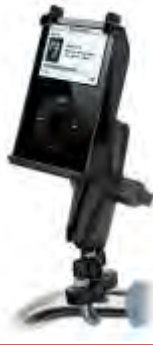
RAM-B-149Z-AP1 RAM U-BOLT MOUNT FOR THE APPLE IPOD