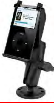
RAM-B-138-AP1 RAM MOUNT WITH 2 7/16" BASE FOR APPLE IPOD