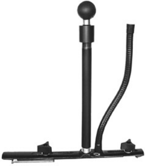
RAM-B-131 RAM AIRCRAFT SEAT RAIL BASE WITH MOUNT