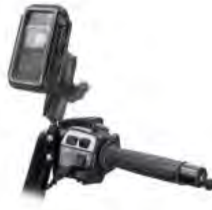
RAM-B-174-AQ3 RAM BRAKE/CLUTCH RESERVOIR SMALL SIZE AQUA BOX