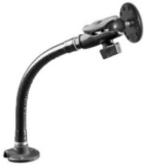
RAM-B-123-9012BU RAM 12" FLEX ARM 90 DEG. BASE SING ARM