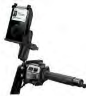
RAM-B-174-AP1 RAM BRAKE/CLUTCH FOR THE RESERVOIR APPLE IPOD