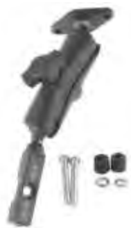
RAM-B-174-238U RAM GOLDWING WITH DIAMOND BASE