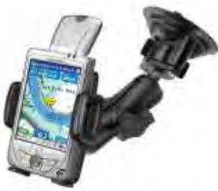
RAM-B-166-UN3 RAM UNIVERSAL SUCTION MOUNT FOR MEDIUM SIZE DEVICES