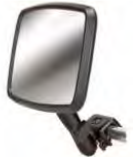
RAM-B-126 RAM WATER SKI MIRROR WITH WINDSHIELD BRACKET