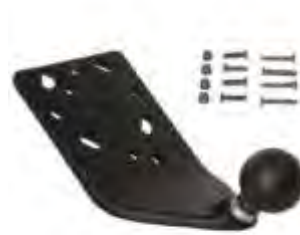
RAM-B-125B-G1U RAM FOR YOKES WITH MOUNTING HARDWARE