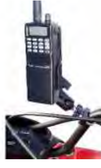
RAM-B-149Z-BC1 RAM WITH U-BOLT BELT CLIP HOLDER HAND-HELD