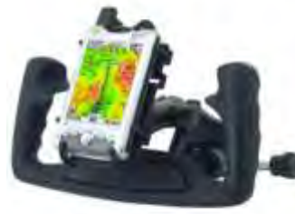
RAM-B-121-PD3 RAM YOKE SYSTEM UNIVERSAL PDA MOUNT