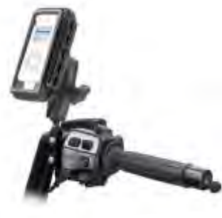
RAM-B-174-AQ2 RAM BRAKE/CLUTCH RESERVOIR MEDIUM SIZE AQUA BOX