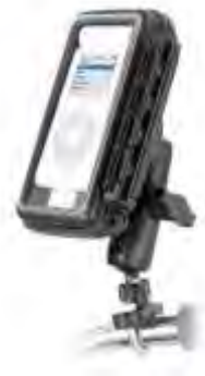
RAM-B-149Z-AQ2 RAM U-BOLT MOUNT MEDIUM SIZE AQUA BOX