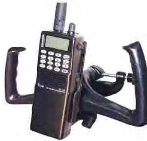
RAM-B-125-BC1 RAM YOKE MOUNT WITH CRADLE FOR BELT CLIPS