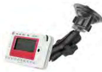
RAM-B-166-XM1 RAM SUCTION MOUNT FOR XM SATELLITE RADIOS