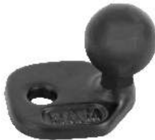
RAM-B-126CU RAM 1.5 X 1.75 BASE 5/16" HOLE & 1"