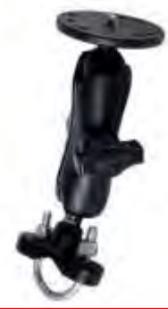
RAM-B-149Z-C1 RAM VIDEO CAMERA MOUNT FOR RAILS & BARS