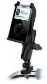
RAM-B-149Z-AP1 RAM U-BOLT MOUNT FOR THE APPLE IPOD