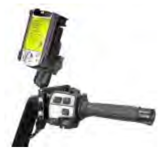
RAM-B-174-CO2 RAM BRAKE/CLUTCH RESERVOIR FOR IPAQ 3000, 5000