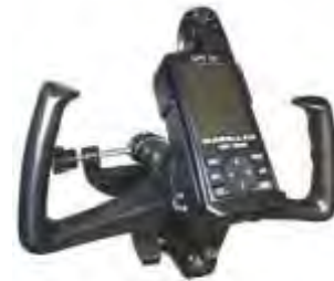
RAM-B-125-MA1 RAM YOKE WITH CRADLE FOR MAGELLAN 315A