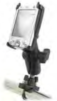
RAM-B-149Z-CO3 RAM U-BOLT MOUNT FOR THE HP 2000 IPAQ