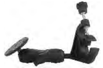
RAM-B-121U RAM YOKE MOUNT WITH BALL & ARM ASSEMBLY