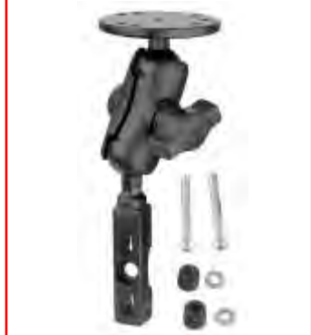
RAM-B-174-202AU RAM GOLDWING WITH 1/4"-20 MALE CAMERA MOUNT