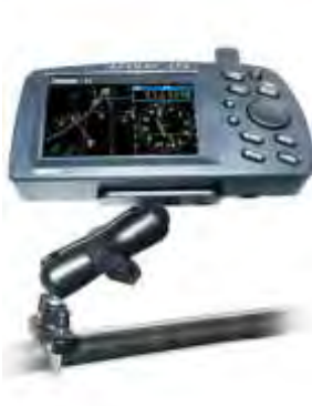
RAM-B-149Z-G1 RAM MOUNT WITH U-BOLT BASE & MOUNTING HARDWARE