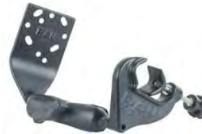
RAM-B-125U UNPKD RAM YOKE MOUNT WITH ANGLED PLATE