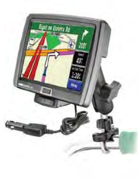
RAM-B-149Z-G3U RAM MOUNT WITH U-BOLT FOR THE GARMIN 7200