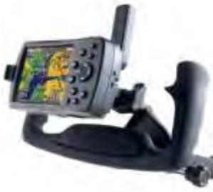
RAM-B-121-GA7 RAM YOKE MOUNT FOR 176, 276, 296