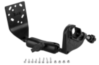
RAM-B-125-G1 RAM YOKE CLAMP WITH MOUNTING HARDWARE