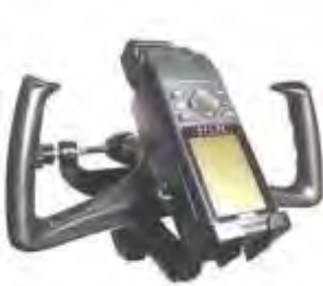
RAM-B-125-GA3 RAM YOKE MOUNT WITH CRADLE GARMIN 89, 90, 92