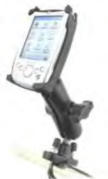
RAM-B-149Z-DE1 RAM U-BOLT MOUNT FOR THE DELL AXIM X5