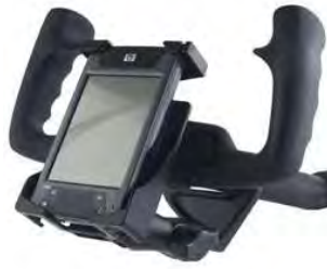
RAM-B-121-PD1U RAM UNIVERSAL PDA CRADLE / YOKE CLAMP