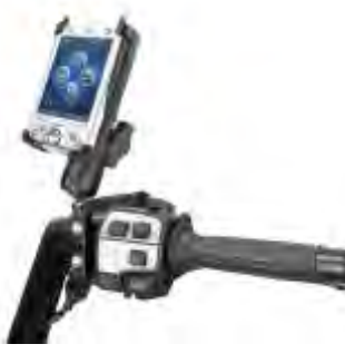
RAM-B-174-CO3 RAM BRAKE/CLUTCH RESERVOIR FOR THE HP IPAQ 2000 SERIES