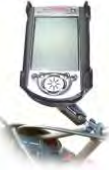
RAM-B-149Z-CO1 RAM U-BOLT MOUNT FOR THE HP IPAQ