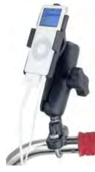
RAM-B-149Z-AP2 RAM U-BOLT MOUNT FOR THE IPOD NANO