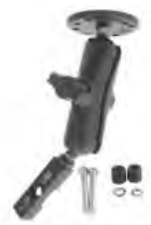
RAM-B-174-202U RAM GOLDWING WITH 2.5 DIAMETER BASE