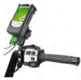
RAM-B-174-CO2P RAM BRAKE/CLUTCH RESERVOIR POWERED DOCK FOR HP IPAQ 3000 & 5000 SERIES