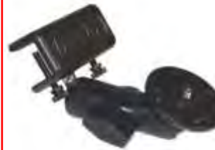
RAM-B-127 RAM WINDOW SCOPE & CAMERA MOUNT