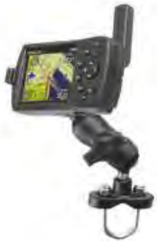
RAM-B149ZA-GA7U RAM U-BOLT MOUNT FOR THE GARMIN 176, 276, 296R