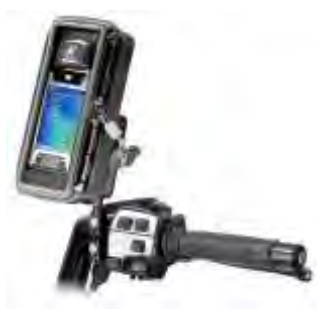
RAM-B-174-AQ1 RAM BRAKE/CLUTCH RESERVOIR LARGE SIZE AQUA BOX