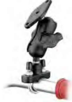
RAM-B-149ZAU RAM RAIL MOUNT WITH A SIZE ARMS