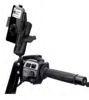
RAM-B-174-AP2 RAM BRAKE/CLUTCH RESERVOIR FOR THE APPLE IPOD NANO