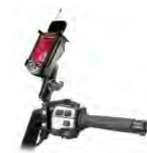
RAM-B-174-CO1 RAM BRAKE/CLUTCH RESERVOIR FOR THE HP IPAQ 3600 & 5000 SERIES