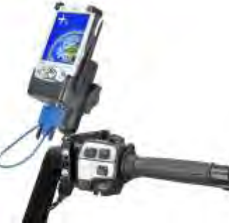
RAM-B-174-CO3P RAM BRAKE/CLUTCH RESERVOIR POWERED DOCK FOR THE HP IPAQ 2000 SERIES