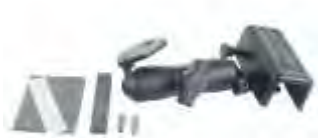
RAM-B-126BU RAM WINDSHIELD MIRROR BRACKET